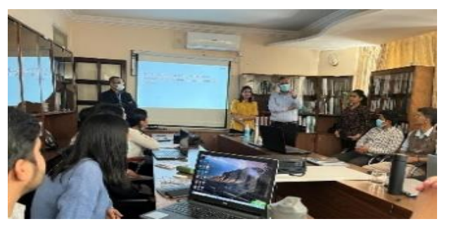
Training at PKF Nepal