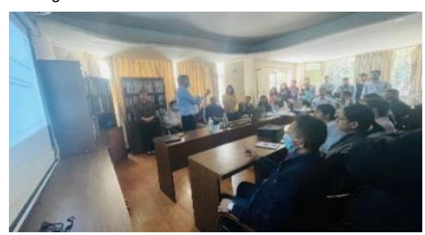
Training at PKF Nepal

PKF Nepal organized training on ISQM, introduction to PKF International, Office etiquettes, Audit work papers and documentation in audit management software 'Inflo', report writing and compilation, scheduled as per the training calendar.